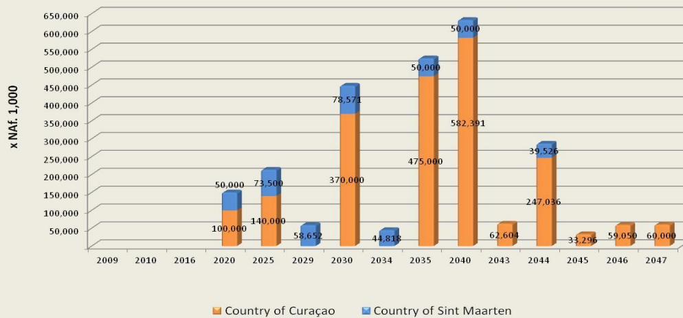
General Government Sinking Bond maturity schedule as per February 28, 2018